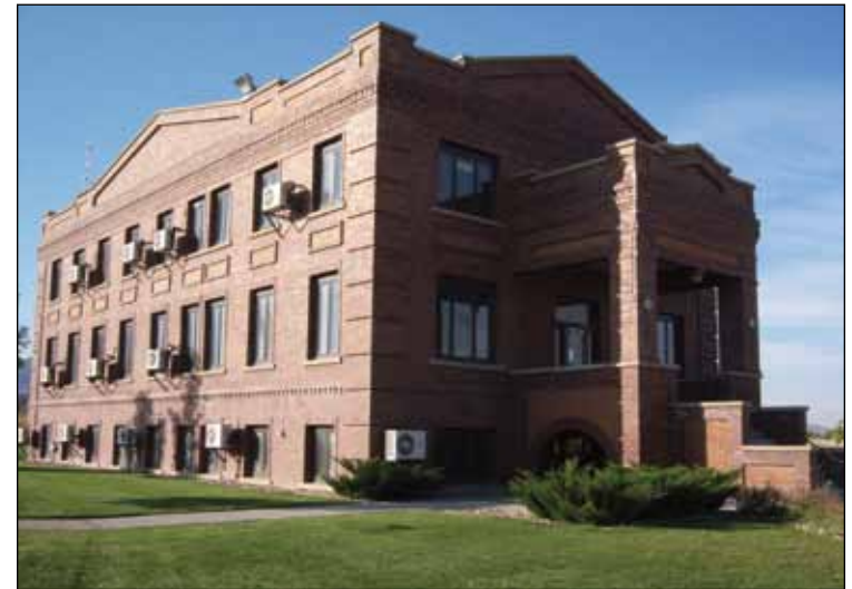
The Casper Business Innovation Center will be housed in the old Amoco Administration Building.

Casper's business incubator will primarily focus on companies with a mix of programs to serve manufacturing, assembly and service businesses. Within five years of operation, the Casper Area Business Innovation Center could create as many as 500 new jobs in the area. It will be housed in the old Amoco Administration Building located in the Platte River Commons Business Park. The facility will be remodeled and expanded while retaining its historical design to create adequate lease space for the new tenants. Leasing the space will provide income to make the business incubator a non-profit entity and a self-sustaining facility.