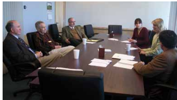
US Representative Cynthia Lummis's visit

CAEDA's Board of Directors established the following committees in 2009: 1) Project and Real Estate Readiness Committee; 2) Technology and Telecommunications Committee; 3) Forward Casper Investor Committee; 4) Transportation Committee; and 5) Industry Partnership Workforce Development Committee. These committees actively research and discuss relevant issues, making recommendations to the CAEDA Board.