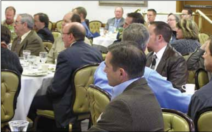
CAEDA investors attend a quarterly breakfast meeting.

The success of CAEDA in local economic development is directly linked to you, the Forward Casper stakeholders. The business expertise, community networking and national contacts you provide are important in Natrona County's economic growth. Staying connected to our investors through special events and publications is a top priority for CAEDA.