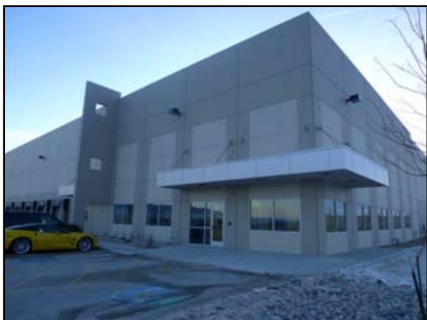
The completed American Tire Distributors' building, located in the Salt Creek Heights Business Park.

American Tire Distributors (ATD) held its Open House for its new building on December 15, 2011. The new building measures nearly 80,000 square feet and is located in the Salt Creek Heights Business Park. This distribution center has been turned over to the lessee and will begin operation this spring with 17 employees.