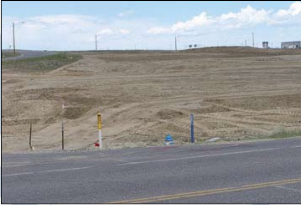
View looking north in May 2009 as lots were being graded.