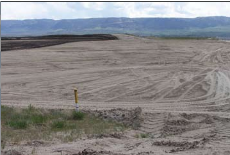
View looking south in May 2009.